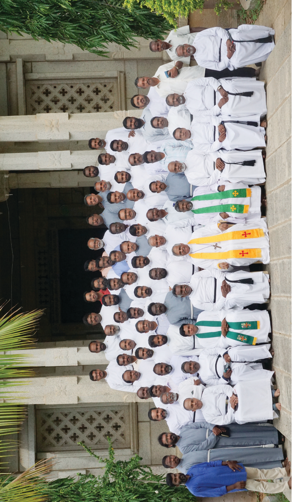
All Pastors and Church workers Conference of CSI Diocese of Cochin held at NMSI Kristukula Ashram, Tirupathur