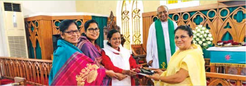
Women's Fellowship Bible Quiz Competition Winners