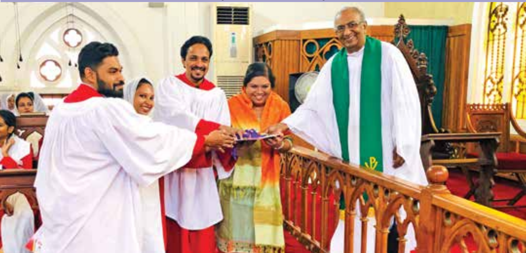
Youth Kalamela Winners