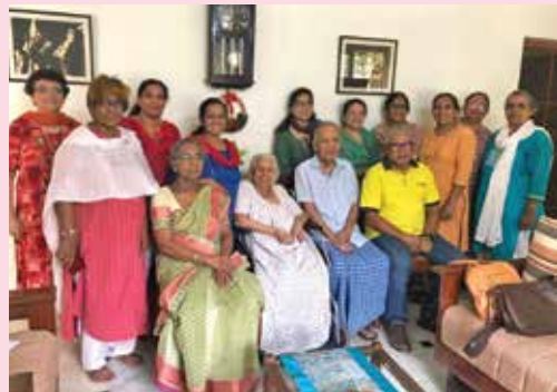
Women's Fellowship Christmas Visit