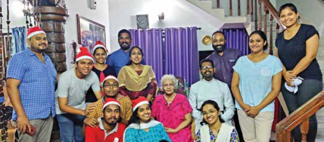
Cathedral Youth Fellowship Christmas Visit