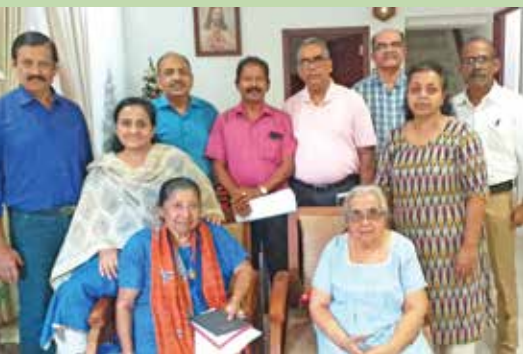
Family Care Fellowship Christmas Visit