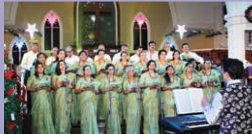
English Service Choir