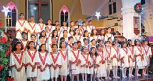
Cathedral Junior Choir