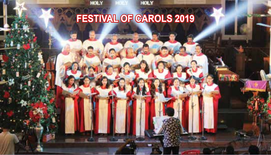
IMMANUEL CATHEDRAL CHOIR