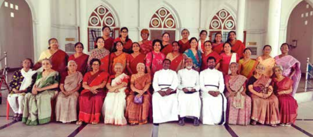
Cathedral Women's Fellowship