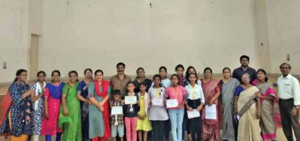
Sunday School Diocesan Exam Winners with Teachers