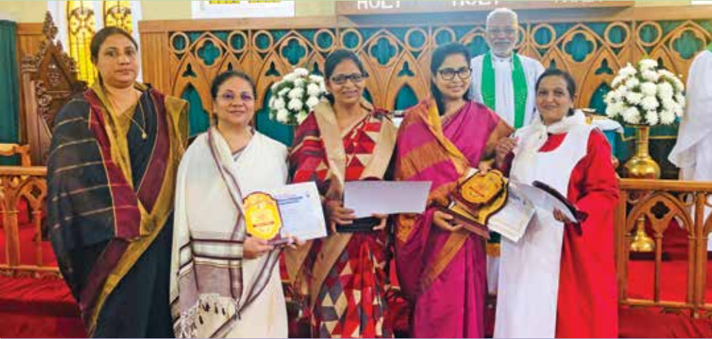
Women's Fellowship Diocesan Bible Quiz Competition Winners