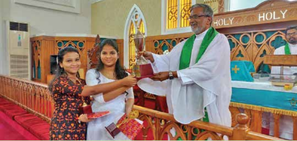
Sunday School YMCA Competition Winners