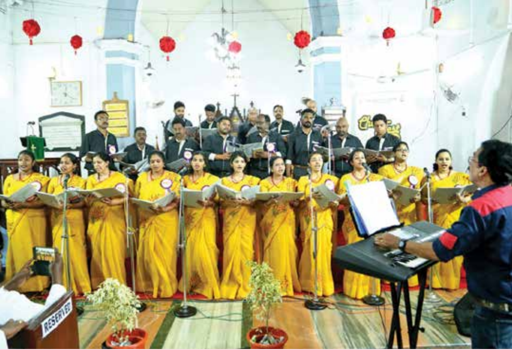
DIOCESE OF COCHIN - CHOIR FEST 2020 15th February 2020 at CSI St. John the Baptist Church, Aluva