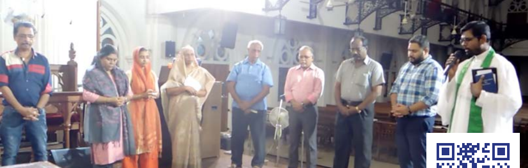
Senior Fellowship Sunday - 20th September 2020