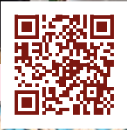
Women's Fellowship Sunday - 13th September 2020