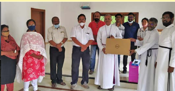
CSI Formation Day 2020 ↓