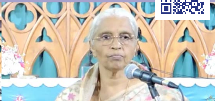
Youth Fellowship Visit to Karunalayam ↓