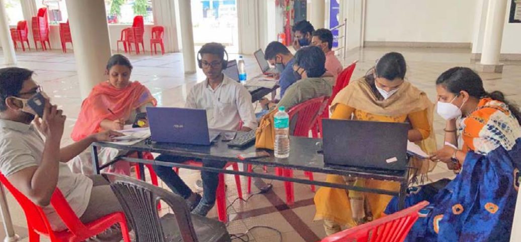
Covid-19 vaccination registration help desk for senior citizens conducted by Cathedral Youth Fellowship.