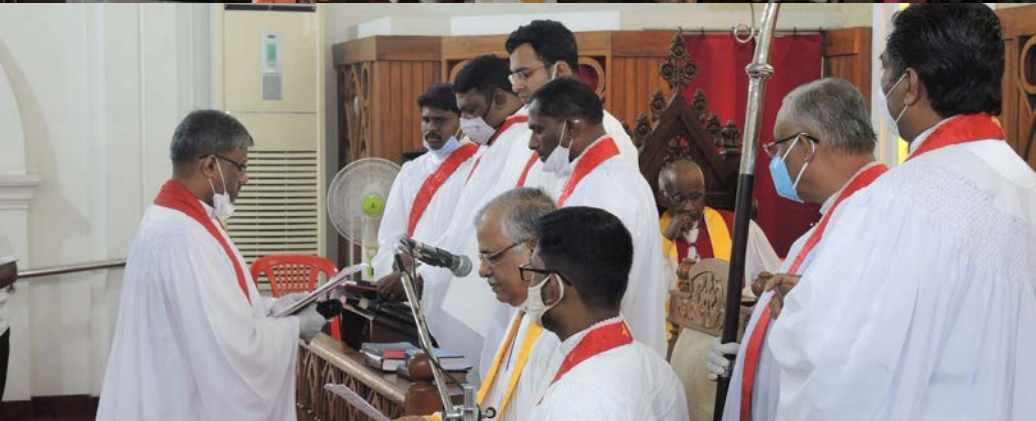
CSI Diocese of Cochin - Ordination Service 2021 on 4th February 2021.