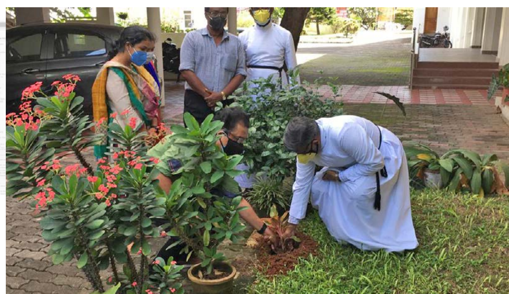
Environment Sunday - 13th June 2021

OT Proverbs 4: 1-19 Psalm 141 Epistle Acts 22: 1-5 Gospel Luke 4: 31-44