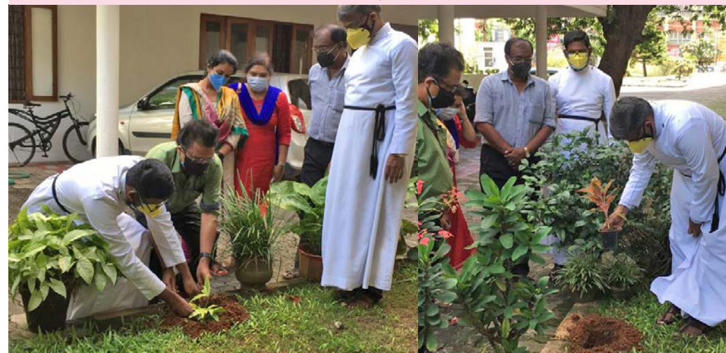
Environment Sunday 2020